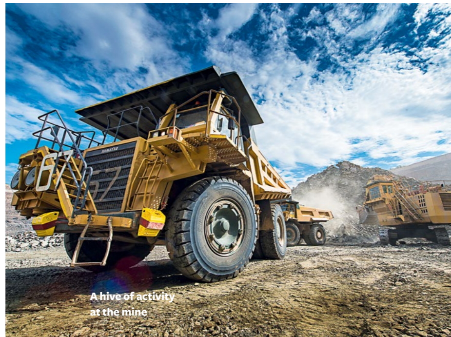
A hive of activity at the mine

“ We believe there is a better way to facilitate diamond sales in a way that can unlock significant value to all... ”