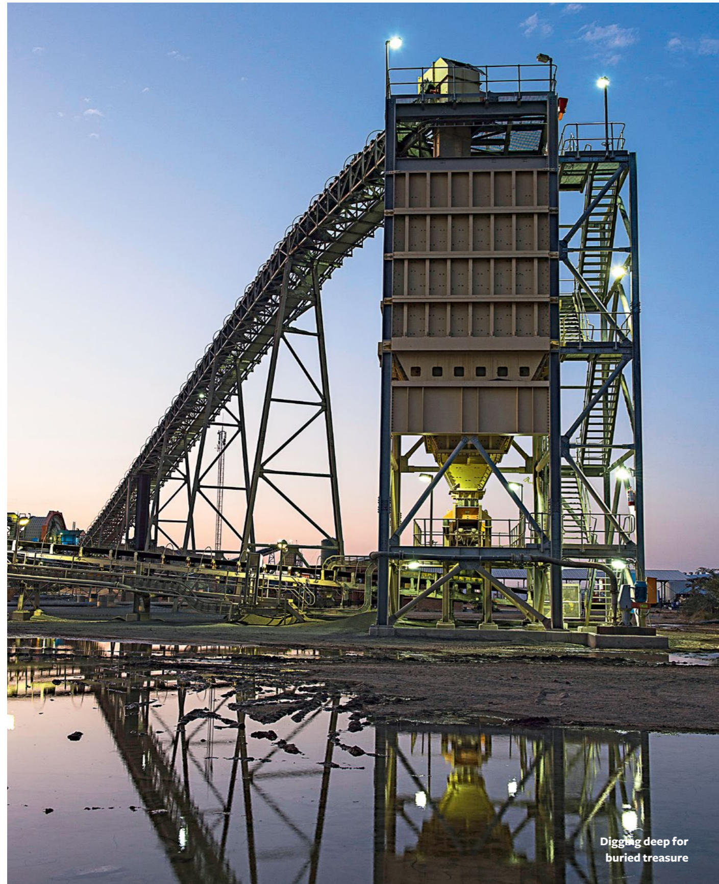
Digging deep for buried treasure

for developing the mine underground and extending minelife to 2036 and beyond – we are dedicated to adding to the existing success of Karowe in every way we can.”