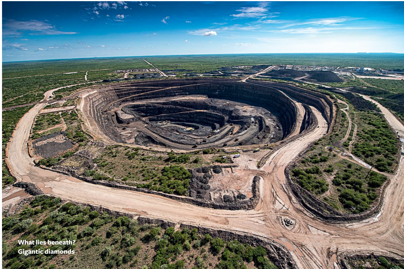
What lies beneath? Gigantic diamonds

“ We believe there is a better way to facilitate diamond sales in a way that can unlock significant value to all... ”