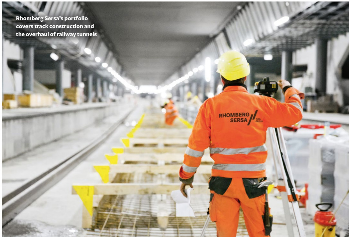
Rhomberg Sersa's portfolio covers track construction and the overhaul of railway tunnels

vider, Rhomberg Sersa offers a complete range of services in railway construction, infrastructure, and machinery for new and existing projects. Its portfolio covers track construction, renewal, and maintenance, and the overhaul of railway tunnels through to electromechanical and technical infrastructure. Rhomberg Sersa also offers innovative products such as slab track construction systems and the SLS Sersa Second Life System®.