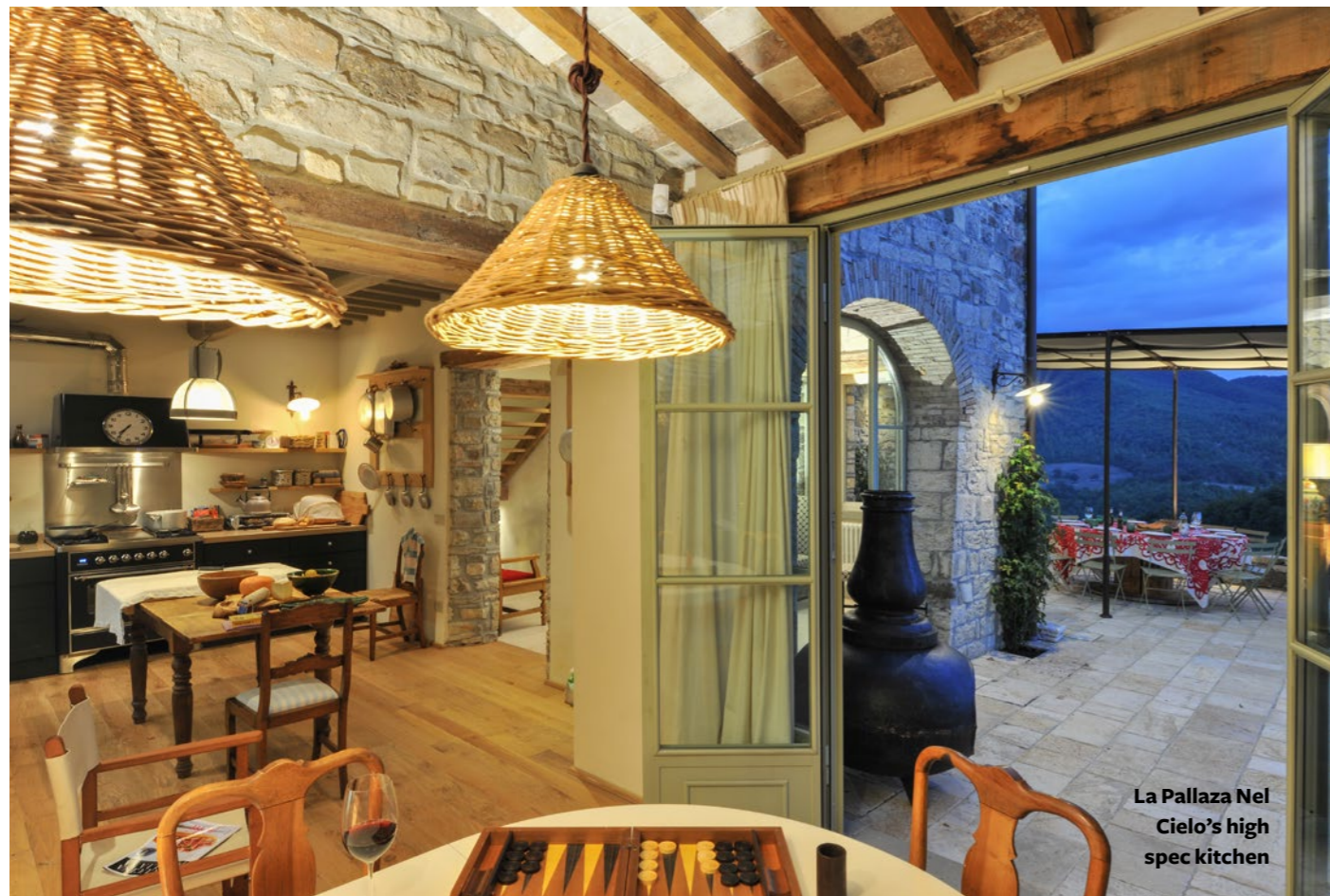
La Palazza Nel Cielo's high spec kitchen